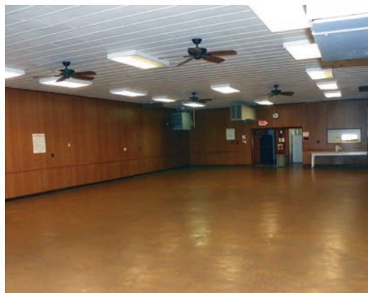
Louisburg's Fox Hall community building will be rehabbed with grant money from the First Option Bank Trusteed Foundation.

date will need to be canceled due to construction. Other rental options located within the City will be provided to those persons at that time.