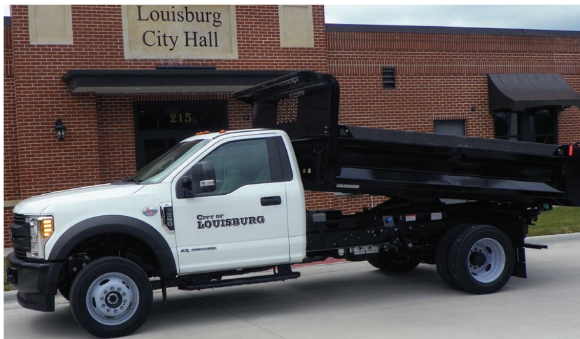
Left: The new Public Works truck was recently delivered. The truck, with a dump bed, will have multiple uses in the City including as a snow plow and salt spreader in the winter.