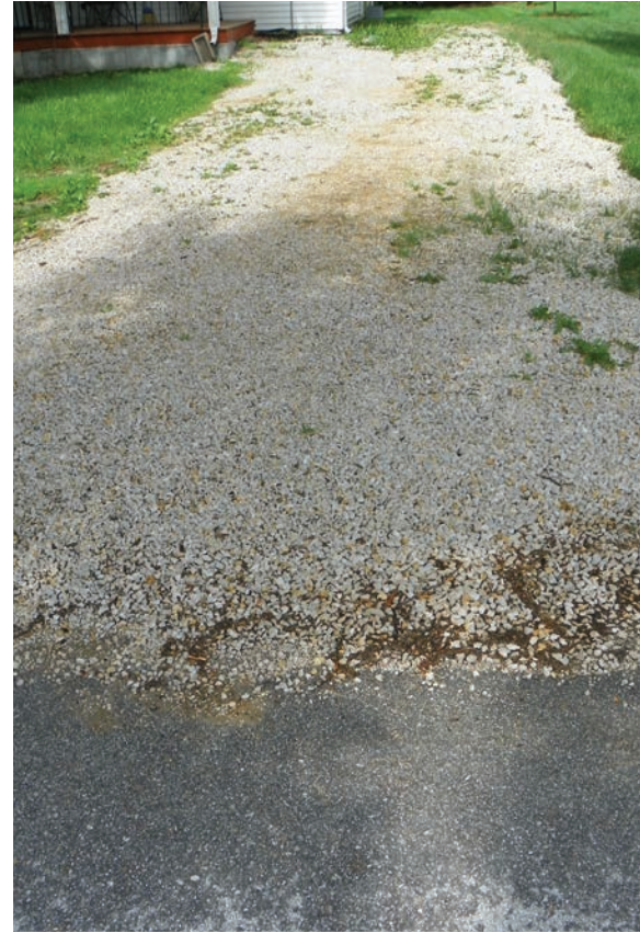
Adding a new gravel driveway to your residence is not allowed in the city limits per the city's Building and Zoning regulations.

Deck construction is often another summertime project and also needs a building permit.